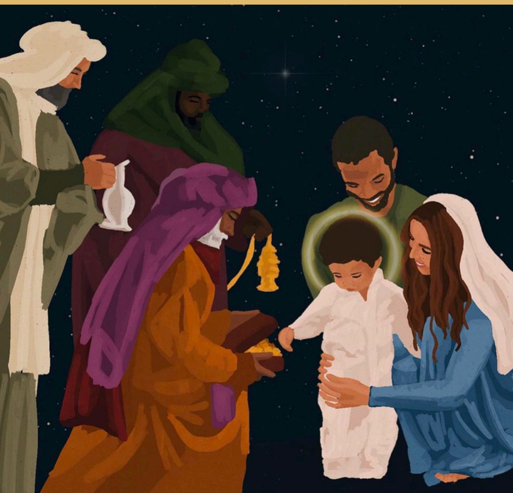
Art by PaxBeloved

4925 CAMBIE ST VANCOUVER BC V5Z 2Z4 604-261-9393 | HOLYNAMEPARISH.CA