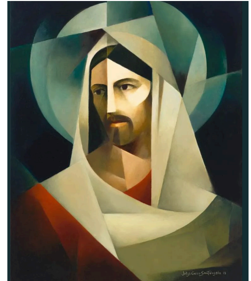
Art by Jorge Cocco Santángelo

Here are some ways to celebrate our parish feast day together: